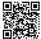
Scan for Facebook Page