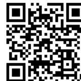
Scan for Facebook Page